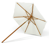
Messina Umbrella 1910101 White Ø×H: 210×220 cm Pole Ø: 3,8 cm Umbrella Foot 30 kg