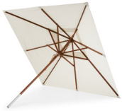
Messina Umbrella 1910136 White W×H: 270×250 cm Pole Ø: 3,8 cm Umbrella Foot 30 kg