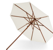
Messina Umbrella 1910111 White Ø×H: 270×250 cm Pole Ø: 3,8 cm Umbrella Foot 30 kg