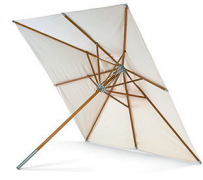
Atlantis Umbrella S1910095 White W×H: 330×277 cm Pole Ø: 4,8 cm Umbrella Foot 50 kg