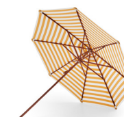
Messina Umbrella 1910138 Golden Yellow Stripes Ø×H: 270×250 cm Pole Ø: 3,8 cm Umbrella Foot 30 kg