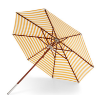
Atlantis Umbrella 1910092 Golden Yellow Stripes Ø×H: 330×275 cm Pole Ø: 4,8 cm Umbrella Foot 50 kg