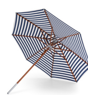
Atlantis Umbrella 1910091 Dark Blue Stripes Ø×H: 330×275 cm Pole Ø: 4,8 cm Umbrella Foot 50 kg