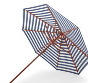
Messina Umbrella 1910137 Dark Blue Stripes Ø×H: 270×250 cm Pole Ø: 3,8 cm Umbrella Foot 30 kg