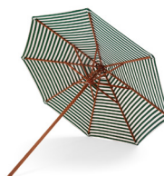
Messina Umbrella 1910119 Light Apricot/Dark Green Stripes Ø×H: 300×240 cm Pole Ø: 4,8 cm Umbrella Foot 50 kg