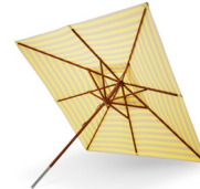
Messina Umbrella 1910121 Lemon/Sand Stripe W×H: 300×270 cm Pole Ø: 4,8 cm Umbrella Foot 50 kg