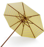
Messina Umbrella 1910118 Lemon/Sand Stripes Ø×H: 300×240 cm Pole Ø: 4,8 cm Umbrella Foot 50 kg