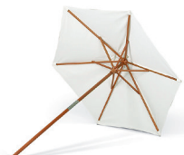
Catania Umbrella S1910130 White Ø×H: 270×250 cm Pole Ø: 3,8 cm Umbrella Foot 30 kg