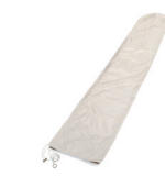
Umbrella Cover S1910210 White Ø×H: 47×184 cm Compatible for Umbrella: Ø210, Ø270, Ø300, Ø330