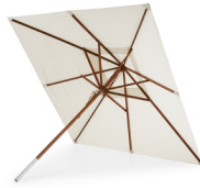
Messina Umbrella S1910120 White W×H: 300×270 cm Pole Ø: 4,8 cm Umbrella Foot 50 kg