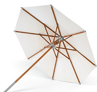
Atlantis Umbrella S1910090 White Ø×H: 330×275 cm Pole Ø: 4,8 cm Umbrella Foot 50 kg