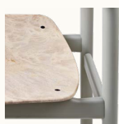
Wood Waste Grey

Conscious Chair designed in 1958 by the renowned Danish furniture designers and architects Børge Mogensen and Esben Klint. The chair is made of FSC® wood and Matek®, where an innovative technology allows us to recycle fibre-based waste materials with recycled plastic waste. It is the first time that a Børge Mogensen design has been relaunched in a different material than the original. The chair is available in three versions.