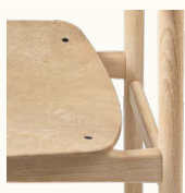
Coffee Waste Light