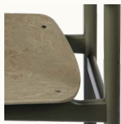
Coffee Waste Green