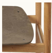
Coffee Waste Dark