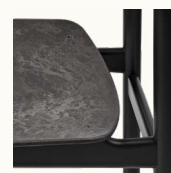
Coffee Waste Black, Beech