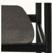
Coffee Waste Black, Oak